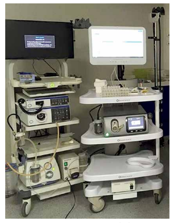
Figure 2. Olympus Evis Exera III tower (left) and FUSE tower (right)

was performed by one of three experienced endoscopists (each of whom had performed more than 5000 colonoscopies). A standard, commercially available, high-definition colonoscope (190 series Exera III NBI system with DF capability) was used for all SFV colonoscopies in this study.